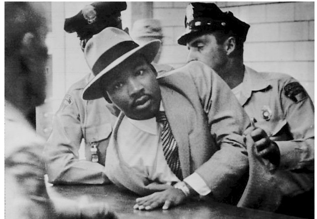
Dr Martin Luther King, Jr. being arrested in Montgomery, Alabama, for "loitering" in 1958

Through vigils, protests and demonstrations over several years, King was arrested and jailed many times.