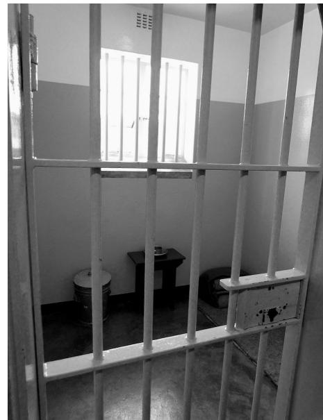
Nelson Mandela's cell at Robben Island, the prison where he spent 18 years of his 27-year incarceration.

On his return later that year, he was arrested and sentenced to five years in prison for inciting workers to strike and leaving the country without a passport. A subsequent trial for sabotage resulted in a sentence of life in prison.