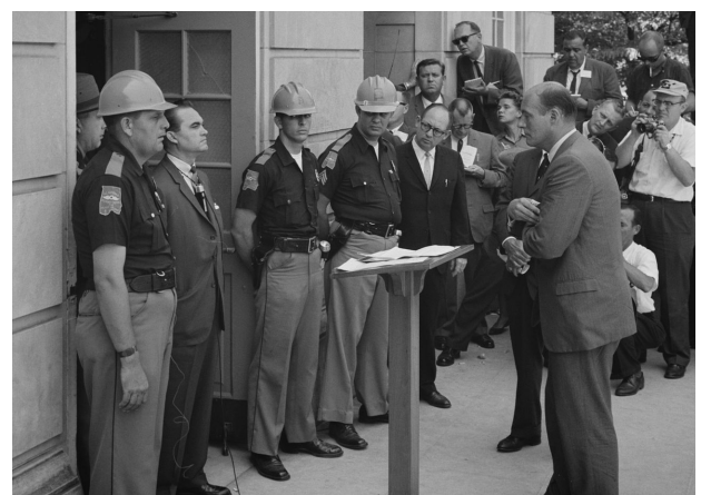
Governor George Wallace attempting to block integration at the University of Alabama, June 1963

As an example of what King and those who fought with him were contending with, in June 1963, Governor George Wallace stood at the entrance to the University of Alabama's Foster Auditorium, refusing to allow its first two African American students to register. He is seen here, supported by state troopers, defying federal deputy attorney general, Nicholas Katzenbach. He eventually departed with members of the national guard, following which the students, Vivian Malone and James A. Hood, succeeded in registering. 24