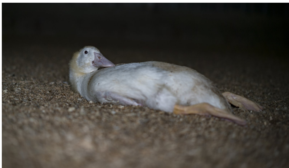
Duck in grower shed, Victoria, Australia.

To further consider an example of cruel practices, the duck shown here is from a duck farm in Victoria. As frequently occurs, he is on his back in a shed, unable to move.