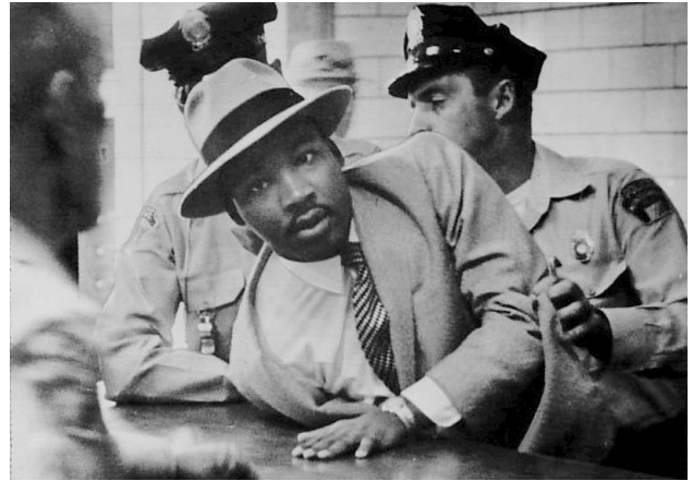
Dr Martin Luther King, Jr. being arrested in Montgomery, Alabama, for "loitering" in 1958

Through vigils, protests and demonstrations over several years, King was arrested and jailed many times.