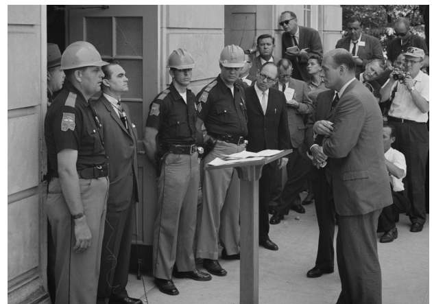
Governor George Wallace attempting to block integration at the University of Alabama, June 1963

As an example of what King and those who fought with him were contending with, in June 1963, Governor George Wallace stood at the entrance to the University of Alabama's Foster Auditorium, refusing to allow its first two African American students to register. He is seen here, supported by state troopers, defying federal deputy attorney general, Nicholas Katzenbach. He eventually departed with members of the national guard, following which the students, Vivian Malone and James A. Hood, succeeded in registering. 25