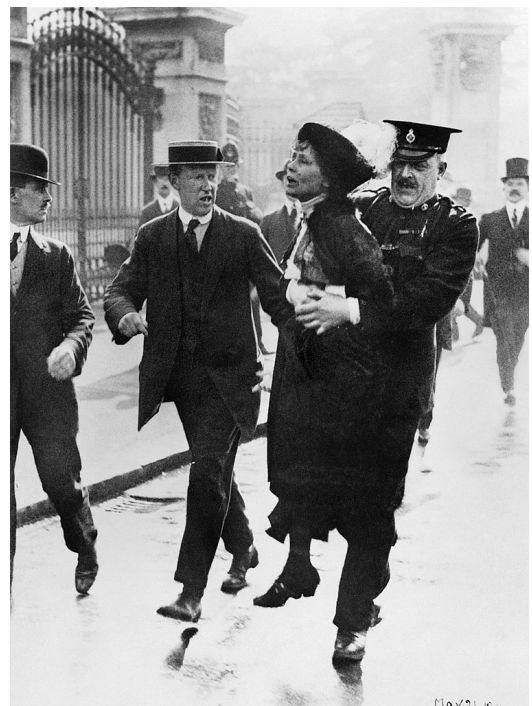
Emmeline Pankhurst arrested outside Buckingham Palace 1914

The London statue was unveiled in 1930 by Prime Minister Stanley Baldwin, who had opposed her cause. Musicians from the Metropolitan Police, some of whom had arrested suffragettes during demonstrations, asked to play for the ceremony.