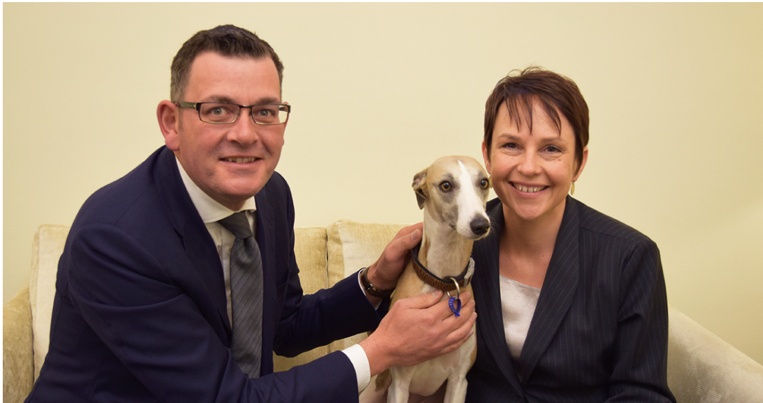
Victorian premier Daniel Andrews and former minister for agriculture Jaala Pulford appearing in the government's announcement of an inquiry into puppy farming

From 10 April 2020, approved commercial dog breeders will be limited to a maximum of 50 fertile female dogs.